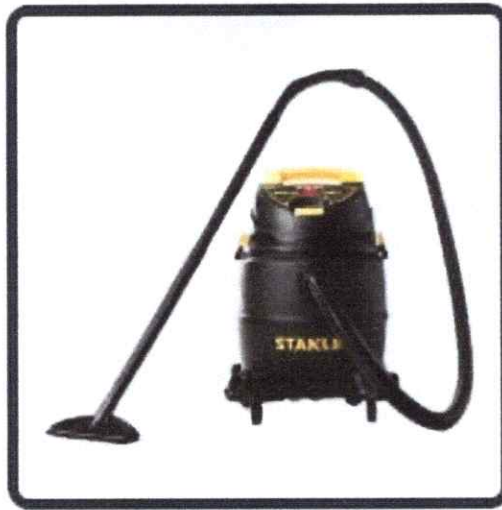
Wet & Dry Vacuum Cleaner